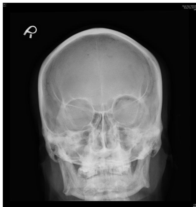
Fig. 4 Orbital X-ray (Caldwell's view) of the same patient in Fig. 3. Discontinuity of the left medial orbital wall suggested the site of orbital fracture.

Traumatic fall is not rare after intraocular surgeries for few reasons. First, there is loss of usual stereopsis. Adaptation to new visual sensation does require time, 4 and a gas-filled eye not only affects visual acuity, but also distorts images by its meniscus level. Second, with prolonged prone posturing after vitreoretinal surgery, patients would feel dizzy on standing and navigating around. Last, in elderly patients with poor