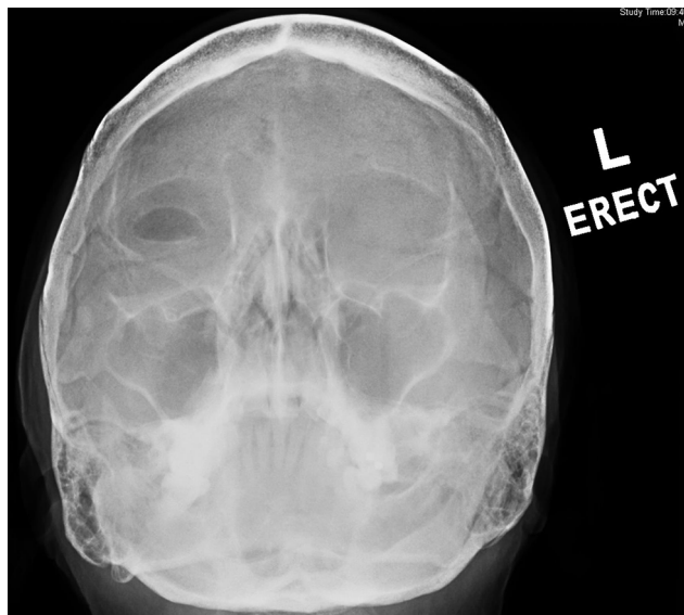
Fig. 1 The bubble eye sign. Orbital X-ray (Waters' view) showing radiolucency over the right orbit. The gas was taking the configuration of a bubble, compatible with gas-filled intravitreal cavity confounded by the eyeball.