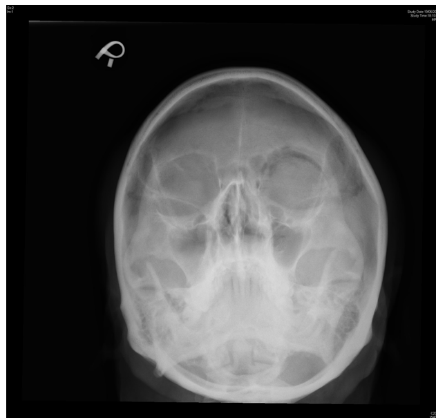
Fig. 3 Orbital X-ray (Waters' view) of another orbital fracture case for comparison. Left orbital emphysema classically seen after orbital fracture was evidenced by the rim of radiolucent gas over the superior orbit. It also outlined the eyeball position, but by its extraocular location.

Volume of intravitreal gas is larger than intracameral gas, and the approximated sphere shaped vitreous cavity allows the intravitreal gas to keep its bubble configuration throughout the whole resorption stages. As gas is radiolucent on radiography, intravitreal gas appears as a radiolucency bubble on X-ray and computed tomography, bounded by the scleral shell, outlining the shape of the eyeball. This "Bubble Eye sign" differentiates intravitreal gas from small orbital emphysema in orbital fracture, when gas is located outside the globe but confined by the orbit, giving a crescent or concave shape usually flowing upwards over the superior orbit (► Figs 3–5).