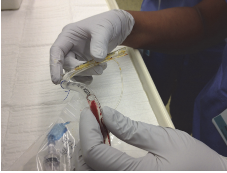
FIGURE 1: Inspection of the lacerated tracheal tube following the safe emergence and extubation of our patient. Note the widened aperture during bending of the tracheal tube and the severed pilot balloon tubing.

tracheal tube was partially severed, resulting in an aperture that opened when the head was turned away from midline.