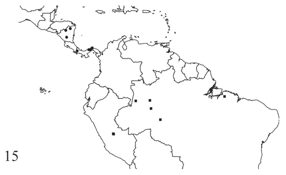
Figure 15. Known distribution map of Amblyodus species. A. taurus (circles) and A. castroi (squares).