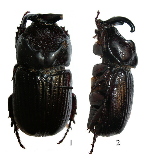
Figures 1-2. Habitus of Amblyodus castroi sp. n., male holotype. I Dorsal view 2 Lateral view.

Paratypes , 4 males and 7 females labeled: 1 female a) "female symbol label", b) "Brasil, Amazonas, Uarini,/ 03°02'57"S/ 65°41'42"W,/ 22/VII-03/VIII/1995, P./ Bührnhein, N.Aguiar & al."; c) handwritten label "NO ALBURNO DE/ TRONCO CAÍDO/ 01/VIII/1995" (CEMT). 3 females labeled "Brasil, Amazonas, Coari,/ Duto