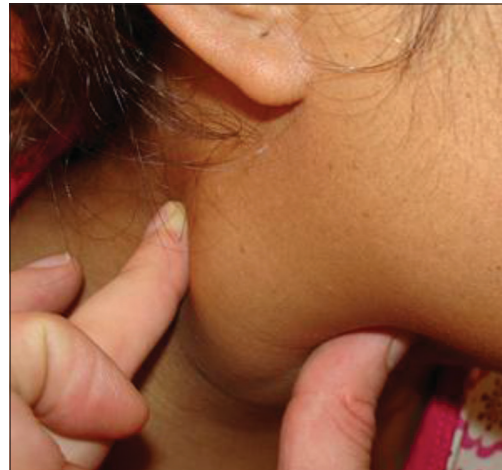
Figure 1: Sensitivity along the internal jugular vein region

suggested by the internal diseases department were found to be negative. All viral serology tests including those for Brucella , HIV, syphilis, and Toxoplasma were found to be negative. After immunological consultation and tests, the following results were obtained: Anti-nuclear anticore, cytoplasmic