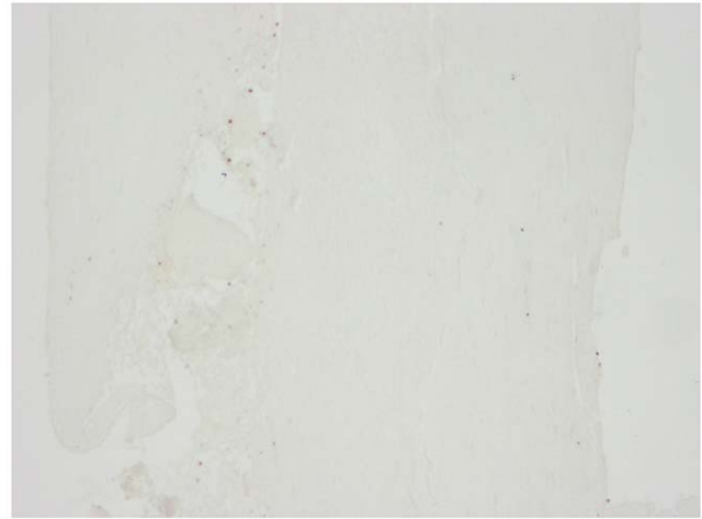
Figure 3. Immunohistochemical staining of lactoferrin (LTF) in advanced human atherosclerotic femoral artery. The picture was taken with 100× magnitude. doi:10.1371/journal.pone.0033787.g003