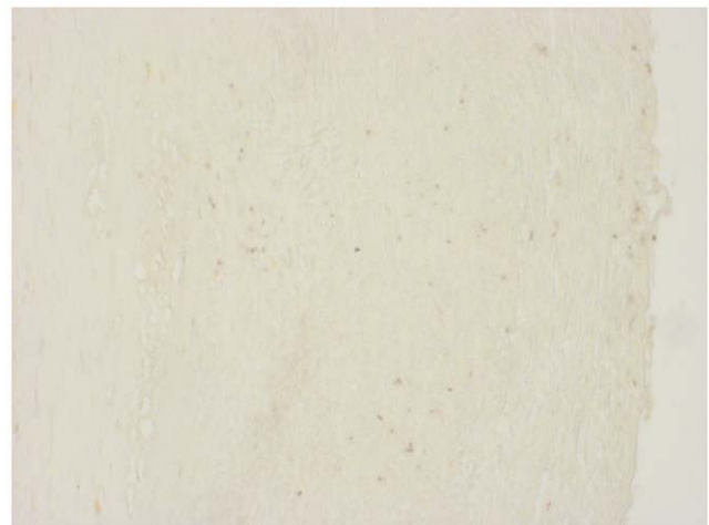
Figure 4. Immunohistochemical staining of lactoferrin (LTF) in advanced human atherosclerotic carotid artery. The picture was taken with 100× magnitude. doi:10.1371/journal.pone.0033787.g004

After carefully examining the GWEA data, we determined nine genes specific for aortic plaques and three genes specific for femoral plaques. We did not find any gene that would have been