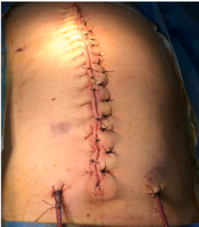
Fig. 5. Final result.

abdominal CT scan and ERCP revealed full CBD transection with biliary peritonitis. The patient was taken to theatre by the local surgical team for midline exploratory laparotomy, washout, and external drainage.