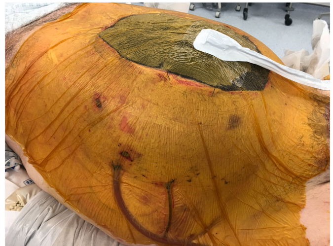
Fig. 4. VAC dressing.

On postoperative day 2, following emergency re-admission