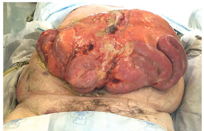
Fig. 1. Extensive burst abdomen with loss of domain.

At the end of our first operation the patient was stable but was kept intubated and transferred to intensive care unit (ICU) to receive more comprehensive therapies including intravenous antibiotics, fluids, and low-weight heparin. In the immediate postoperative course nutrition was provided via total parenteral nutrition (TPN) while an early enteral