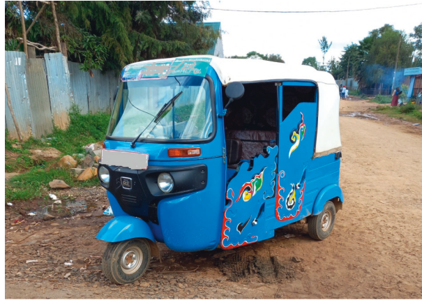
FIGURE 1: Three-wheel car.

objects, and prolonged uncomfortable postures while driving are risk factors for LBP [17, 18]. The type of vehicle seat as well as occupational risk factors such as long daily working hours, years of driving, and pressure to compete are the main ergonomic risk factors contributing to LBP [14, 19–21]. However, the extent to which these risk factors are associated with LBP among three-wheel drivers is unknown. Thus, the aim of this study was to identify ergonomic risk factors of LBP among three-wheel drivers in the Jimma city, Ethiopia.