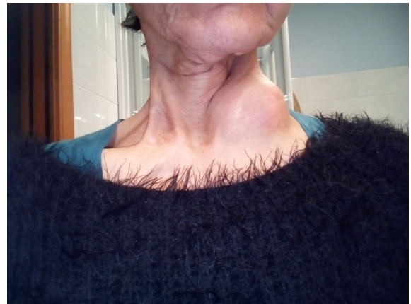
Fig. 2. Left supraclavicular mass.