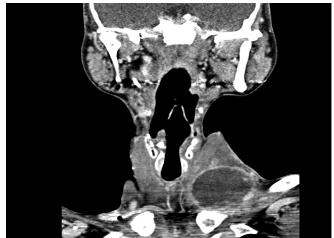
Fig. 3. CT scan showing the oligoprogressive site in the left level 4 and supraclavicular fossa (coronal view).

the dosimetric summation of previous plans, we decided to re-irradiate this second oligoprogressive lesion with VMAT delivering 30 Gy at conventional fractionation, keeping the patient on Nivolumab (Supplementary Fig. 4). Right before the start of treatment on 17/5/19, the overlying skin was infiltrated, with a 4 × 3 cm lesion (Supplementary Fig. 5). During treatment, a 2 cm ulcerative loss developed, requiring the application of daily wound dressings. The treatment was completed on 10/6/19, with mild toxicity. A