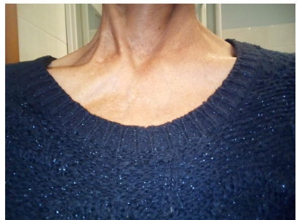
Fig. 4. Complete response in the left supraclavicular mass.

the dosimetric summation of previous plans, we decided to re-irradiate this second oligoprogressive lesion with VMAT delivering 30 Gy at conventional fractionation, keeping the patient on Nivolumab (Supplementary Fig. 4). Right before the start of treatment on 17/5/19, the overlying skin was infiltrated, with a 4 × 3 cm lesion (Supplementary Fig. 5). During treatment, a 2 cm ulcerative loss developed, requiring the application of daily wound dressings. The treatment was completed on 10/6/19, with mild toxicity. A