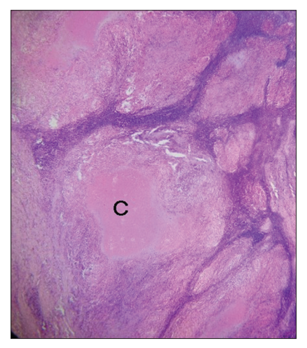
Figure 1: Photomicrograph of tuberculous lymphadenitis showing tuberculoid granulomas with central areas of caseous necrosis [C] (H and E, ×40)