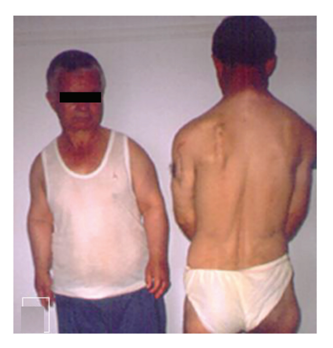
Figure 2. Subjects III-2 and III-4 (are siblings) showed the severe short stature (-4 SD), short-limbed dwarfism dysplasia but with no exostosis of subject III-4, next subject (sibling), whereas subject III-4 showed normal height, multiple exostosis, scoliosis but no mesomelia. Note multiple scars of previous operations to remove exostosis along the scapula and the upper posterior left humerus.

AP radiograph showed ulna of subject IV-12's radius was short in relation to ulna. Ulnar and palmar slant of the radial articular surface and triangulation of the distal radial epiphyses were noted. The overall features were compatible with Leri-Weill dyschondrosteosis syndrome (Fig. 3d). X-ray of the tibia and fibula of the father (III-2) showed the apparent shortening of the long bones and the multiple exostosis (Fig. 3e).