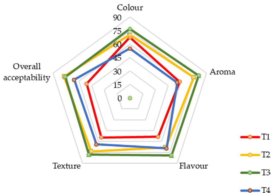
FIGURE 3 Variation of sensory properties in cream cheese with varying levels of CLP incorporations. T1, T2, T3, and T4 contain varying levels of dried CLP w/v = 0% (control), 0.15%, 0.2%, and 0.25%, respectively

The appearance of CLP-incorporated cream cheese is shown in Figure 2. The sensory evaluation revealed that the 0.2% CLP (T3) ranked the highest score for color, aroma, flavor, texture, and overall acceptability while the 0% CLP (control) ranked the lowest acceptance for tested organoleptic properties (Figure 3), thus demonstrating the possibilities of developing a cream cheese containing 0.2% of CLP with an acceptable level of organoleptic properties. \alpha -pinene, sabinene, \beta -pinene, 1-phenylethanethiol, linalool-like odorants with flavor dilution (FD) factors majorly contribute to the aroma of curry leaves (Verma et al., 2012). The unique sulfur and burnt odor is a