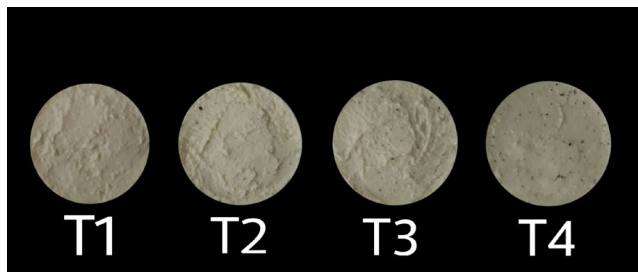
FIGURE 2 Dried curry leaves powder (CLP)-incorporated fresh cream cheeses. T1, T2, T3, and T4 contain varying levels of dried CLP w/v = 0% (control), 0.15%, 0.2%, and 0.25%, respectively

The results of the DPPH assay showed a gradual and significant increase in the antioxidant activity with each level of CLP inclusion (Table 3). The untreated sample (T1) had the highest IC_{50} value ( 0.09 \pm 0.00 ) which indicates the lowest antioxidant capacity, while the T4 sample resulted in the lowest IC_{50} value ( 0.06 \pm 0.00 ) and thus reflects the highest antioxidant capacity among the treatments. In curry leaves, the carbazole alkaloids (e.g., mahanimbine and koenigines) have been reported to exhibit antioxidant potentials (Ramsewak et al., 1999; Tachibana et al., 2001; Tachibana et al., 2003). Hence, it can be assumed that the higher antioxidant capacity observed in the CLP-incorporated cream cheeses is a direct impact of carbazole alkaloids in CLP that was added into the cream cheese base in the current study. Similar observations were made when curry leaves essential oil incorporated with a milk-based confection, burfi , a popular confection of the Indian sub-continent (Badola et al., 2018). Authors reported the inclusion of curry leaves essential oil into burfi enhanced the storage stability without compromising the sensory acceptability.