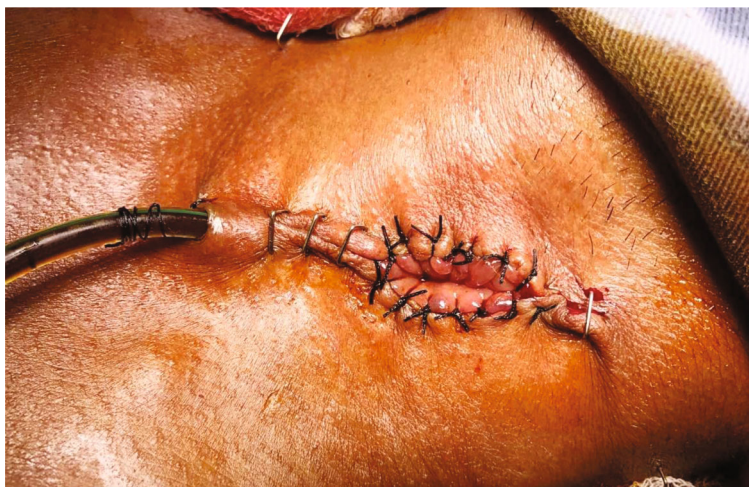
FIGURE 3: Exteriorized esophagus.

provide a satisfactory history and chest X-ray is inconclusive, other modalities of diagnosis like CT scan and diagnostic endoscopy are generally the preferred modalities. Pleural effusion, pneumomediastinum, subcutaneous emphysema, hydrothorax, and pneumothorax are some other indirect signs of esophageal injury that aid in the diagnosis [11]. Apart from demonstrable perforation, our patient also had a bilateral pleural collection, pneumomediastinum, and subcutaneous emphysema in the neck.