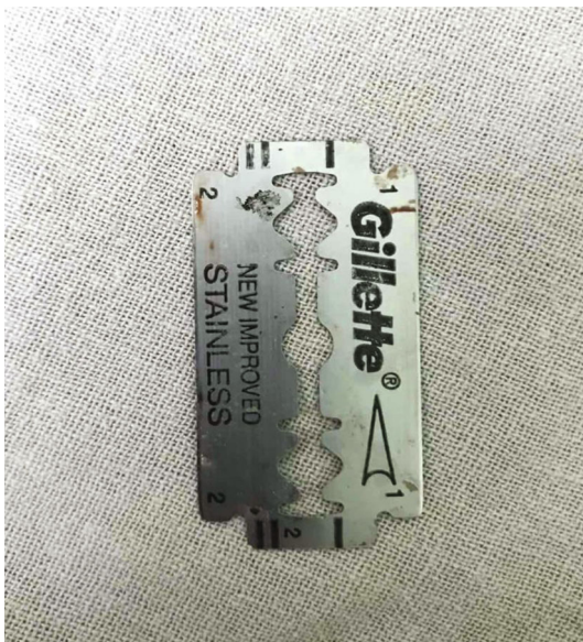
FIGURE 2: The razor blade after removal.

causing a 45 mm perforation at its lateral aspect at T 6,8 level with extensive pneumomediastinum and surgical emphysema in the neck along with bilateral pleural effusions (Figure 1).