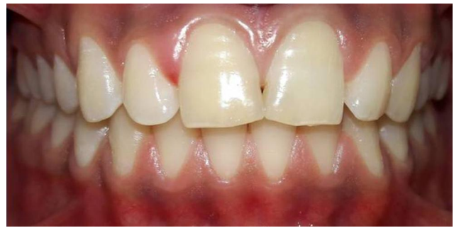
Figure 4 Photograph after completion of bleaching procedures.

This case report demonstrates the management of discoloration of tooth #61 after the placement of WMTA. MTA is a material used worldwide in a variety of clinical