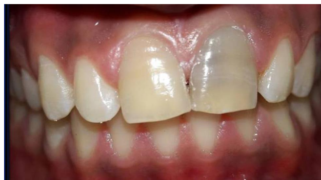
Figure 2 Grayish discoloration #61.

The patient was reviewed at 3, 6, and 9 months. After 9 months, the patient came to the department with grayish discoloration in #61 and now he was concerned by the crown discoloration (Figure 2). The periapical lesion that was present in #61 had healed and continued apical root maturation was radiographically evident. The lesion that was present periapically in #51 was in the state of healing, whereas the lesion in its lateral aspect had healed