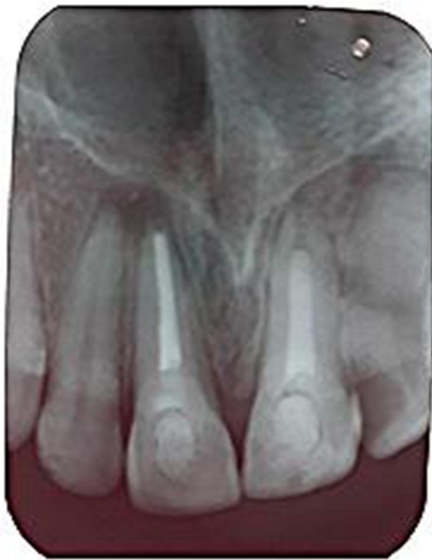
Figure 3 Image taken 9 months later revealing significant remineralization in the periapical region.

(Figure 3). The patient was advised of different treatment options such as internal bleaching, a veneer, or a crown. The patient was also advised of the risks of internal bleaching. As internal bleaching is an economical dental treatment, patient was convinced by this option only. Internal bleaching was performed with sodium perborate (Sodium Perborate Teeth Whitening; Sultan Healthcare). A mixture of sodium perborate and saline was placed in the access cavity to internally bleach the crown. Then, the access opening was sealed with Cavit W (3M, Dental Products Division, St Paul, MN). The patient returned 2 weeks later and the same procedure was repeated. After completion of the bleaching procedures, under rubber dam isolation, the tooth was reaccessed, the internal bleaching paste was removed, and the access cavity was subsequently restored with resin composite restoration (Figure 4).