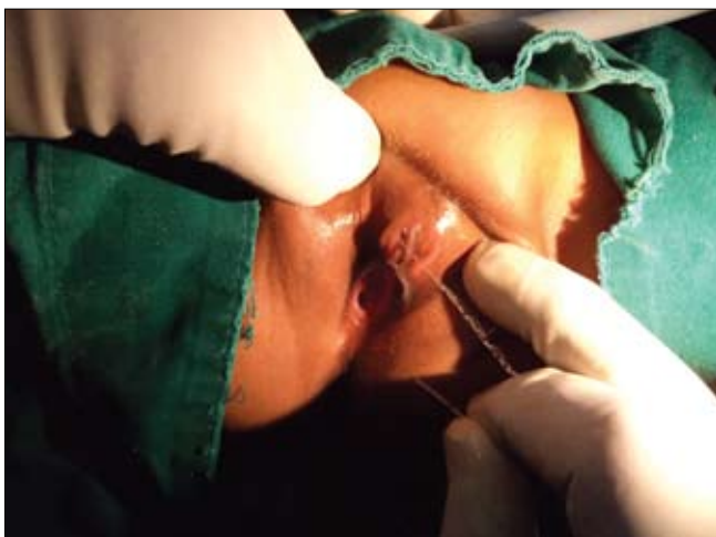
Fig. 1. A visible stream of urine from the accessory urethra after applying suprapubic pressure.

Pubic symphysis was intact and was not split. Hemogram and blood chemistry was normal. Intravenous urography revealed functioning horseshoe kidneys. Micturating cystourethrogram showed smooth walled good capacity bladder and no reflux. Cystoscopy was done under general anesthesia through a normal urethral meatus and showed a normal anatomy of the urethra, bladder neck, and ureteric orifices. A narrow stream of urine was observed gushing out through a small opening located over the clitoris after applying suprapubic pressure with a full bladder. Through a 24 French intravenous canula placed over the clitoral opening, methylene blue was injected. A narrow blue stream was observed effluxing through an opening located above the normal bladder neck confirming the diagnosis of urethral duplication. The bladder was opened through suprapubic incision and there were two internal urethral meatuses with well developed bladder necks, the accessory one located above