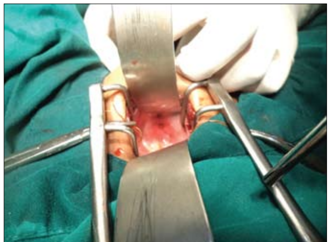
Fig. 2. Accessory urethra opens into the bladder, just above the bladder neck.