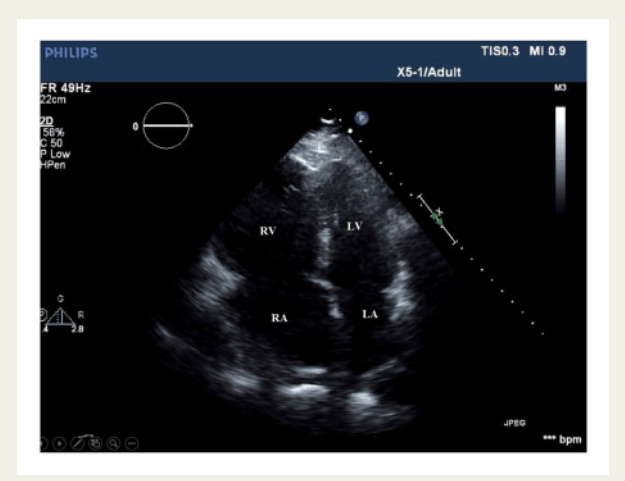
Figure 2 Four-chamber view showing RV and RA enlargement. RA, right atrium; RV, right ventricle; LA, left atrium; LV, left ventricle.

ward. He was continued on his home aspirin 81 mg, atorvastatin 20 mg, and lisinopril 20 mg, in addition to being placed on an insulin lispro sliding algorithm and enoxaparin 40 mg subcutaneously daily for deep vein thrombosis prophylaxis. On hospital day 1, an infectious disease consultant recommended SARS-CoV-2 nasal swab PCR testing. The following day, his SARS-CoV-2 test returned positive and 2.5 L of O<sub>2</sub> by nasal cannula was required for an oxygen saturation of 80% with ambulation. Azithromycin and ceftriaxone were discontinued, and he was managed with an albuterol metered dose inhaler 2.5 mg every 6 h. On hospital day 3, a persistent sinus tachycardia (110 b.p.m.) was unfortunately only treated with metoprolol tartrate 12.5 mg b.i.d. On hospital day 5, tachycardia worsened with heart rates in the 130s, hypoxia requiring 15 L by non-rebreather mask, and acute kidney injury with creatinine elevation to 1.7 from 1.1 mg/dL (normal range 0.5-1.3 mg/dL). Cardiology consultation recommended an echocardiogram and D-dimer. The echocardiogram demonstrated severe right ventricular dilation (Figure 2, Supplementary material