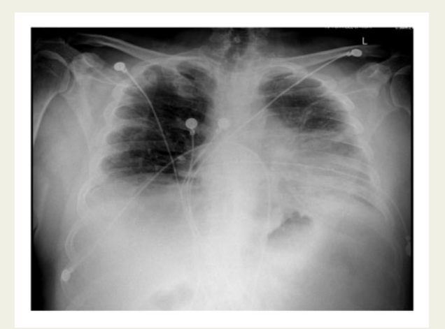
Figure | Chest radiogram showing bilateral opacities.

His chest radiogram ( Figure 1 ) demonstrated bilateral opacities, left worse than right. He was given ceftriaxone 1 g every 24 h and azithromycin 500 mg once, and was admitted to the general medical