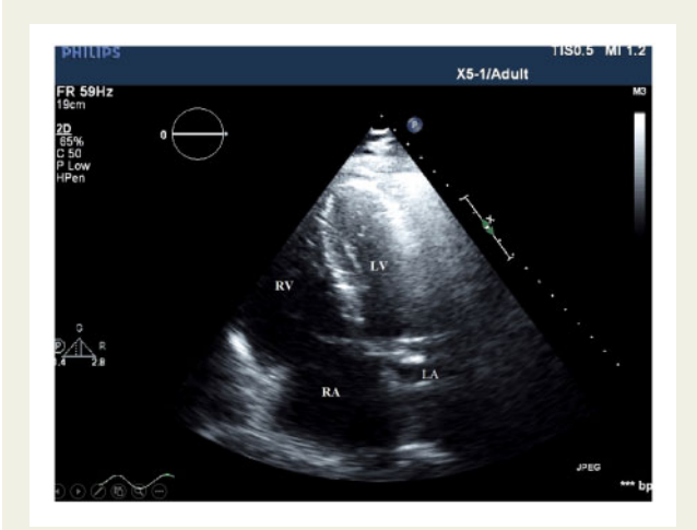
Figure 4 Four-chamber view following thrombolysis. RA, right atrium; RV, right ventricle; LA, left atrium; LV, left ventricle.

online, Movie 1), right ventricular dysfunction, severe pulmonary hypertension, and extensive clot in transit ( Figure 3A and B ; Supplementarty material online, Movie 1) in the right atrium. D-dimer returned at 14 000 ng/mL (normal range <500 ng/mL). Worsening hypoxia and acute kidney injury precluded a CT pulmonary embolism scan. Thrombolytic therapy with tissue plasminogen activator (TPA) followed by a heparin drip was recommended by the Heart Team (Cardiology and Cardiothoracic surgery consultation teams). Oxygenation improved and required only a 2 L nasal cannula within 24 h. On hospital day 6, an echocardiogram demonstrated resolution of the right atrial thrombus ( Figure 4 , Supplementarty material online, Movie 2 ) with improvement in pulmonary artery pressures. On hospital day 9, he was transitioned to apixaban with a planned duration for 3–6 months. The patient was discharged home on 2 L of oxygen