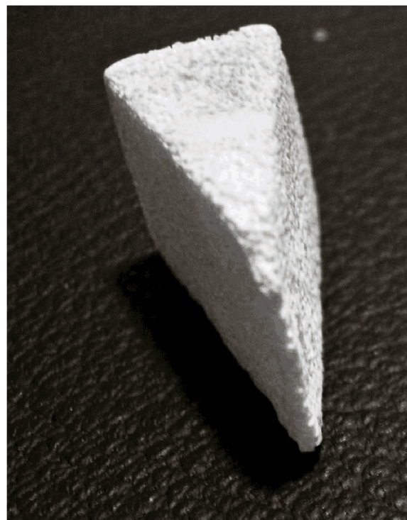
Figure 1 Freeze-dried bovine xenograft.

Between September 2006 and October 2007, twelve consecutive non randomized patients underwent subtalar arthrodesis with interposition of a bone graft block for the treatment of calcaneal fracture malunion. Autologous tricortical iliac crest graft (autograft group) was used in six patients (six cases) and freeze-dried cancellous bovine xenograft bone block (xenograft group) in six patients (six cases) (Figure 1). A total of twelve nonrandomized patients were prospectively analyzed with a mean followup of 58.17 weeks (range, 42 to 82 weeks). A bone graft of each type was used in the first two operated cases. Tricortical autograft was then used in the next five cases,