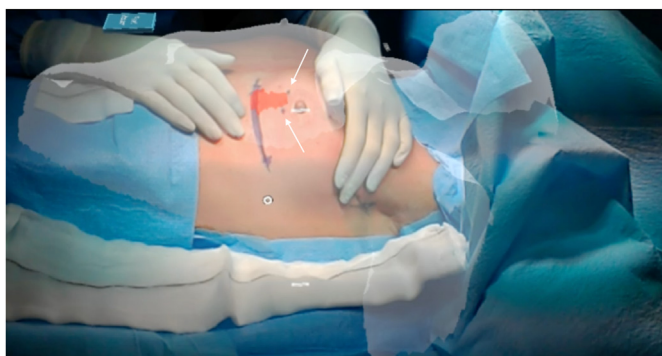
Fig. 5. - Surgeon view of the phantom model (with tumor location) synchronized with the patient through augmented reality. An overlap is observed between the two carbon tattooing marks (white arrows) and tumor projection with augmented reality in the red colour.

Pathology: 17 mm tumor was removed consisting of intermediate grade DCIS with free margins and one negative sentinel lymph node. No invasive cancer was found. Final TNM staging was pTis pN0(sn)cM0.