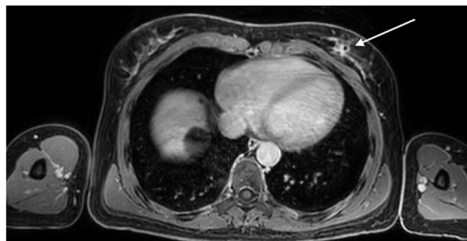
Fig. 2. Left breast cancer lesion with clip artifact visible at MRI with the patient in the supine position.

overlap between both modalities, including tumor, using BSM to perform spatial alignment between both modalities (Fig. 3). A patient-specific 3D digital breast model was processed and converted to a point cloud breast 3D model, referred hereafter as phantom model (Fig. 5), ready to be uploaded to an AR headset: HoloLens 1.