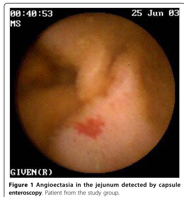
Figure 1 Angioectasia in the jejunum detected by capsule enteroscopy. Patient from the study group.

These patients were compared to a retrospective control group consisting of 24 patients diagnosed with diverticulosis, also identified from the records of the Department of Gastroenterology at the Stockholm Söder Hospital spanning the same time period as the study group. The mean age of the control group was 73 (35-86) years and 15 were females (62%). All patients in the control group had a gastroscopy and a colonoscopy