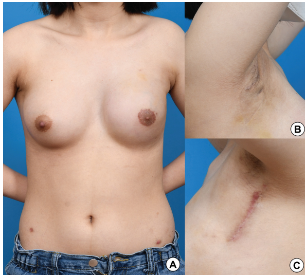
Fig. 3 Case 1, 18-year-old female patient with Poland syndrome (left side). (A) Six-month postoperative clinical image. (B, C) Postoperative scar on both axilla.

as follows: the problem of the robot arm inserted from the patient's head side frequently colliding with the patient's head and arm in the previous da Vinci system was resolved and no additional incision was required, thus demonstrating aesthetic superiority. The articulation of the flexible camera and the instruments led to drastic improvements in the field of view in the deep inferior margin beyond the posterior curvature of chest wall and the range of motion of the robotic arm.