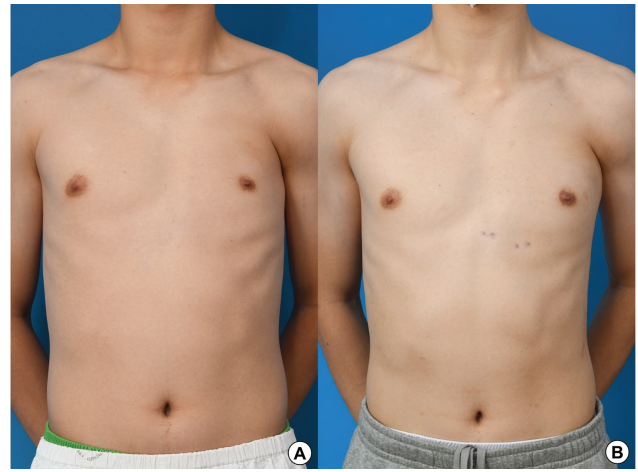
Fig. 4 Case 2, 18-year-old male patient with Poland syndrome (left side). (A) Preoperative clinical image. (B) Six-month postoperative clinical image.

When using the conventional robotic system, RLDF surgery is a gasless surgery that involves the use of a long retractor because it is difficult to retract the LD using a robot arm alone. However, in the case of the da Vinci SP system, since the third arm is always within the field of view, stable retraction can be performed and harvesting is possible only with gas inflation. In addition, surgery using a SP system with gas enables smaller incisions. In previous studies, an incision of 5 to 6 cm was required. 6,10 Joo et al performed prosthetic breast reconstruction through an incision of 2.5 to 4.7 cm using the da Vinci SP system with a gasless technique. 11 In our study, RLDF surgery was performed through a 5-cm incision in the midaxillary crease and augmentation mammoplasty was performed through a 3-cm incision in the axillary crease with gas inflation. With the da Vinci SP system, the prognosis of postoperative skin necrosis or scarring is superior because not only is the length and