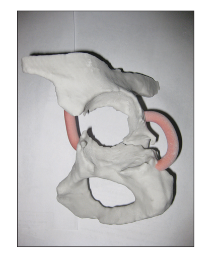
Figure 1: Plaster model of the acetabulum. Female, 74-year old. Pelvic discontinuity

With 3D models, we could not only verify the acetabular defects and classify it but very clearly plan the way of the