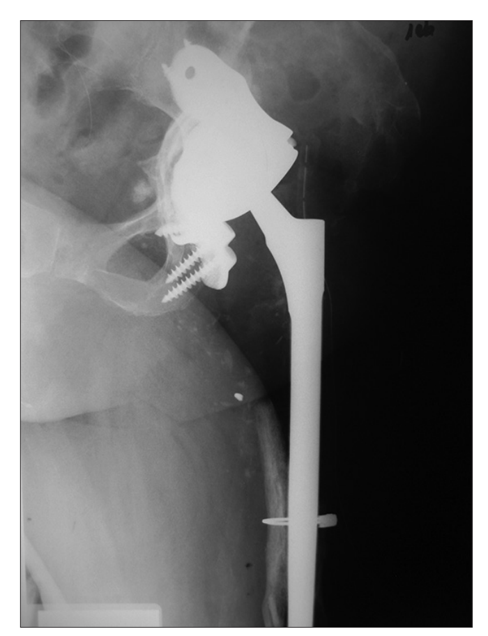
Figure 2: Postoperative X-ray (L) hip with thigh anteroposterior view showing custom made triflange acetabular component printed on the three-dimensional printer

Statistical analysis was performed with Statistica 10 software. Kolmogorov–Smirnov (P < 0.1) and Lilliefors (P < 0.01) tests were used for normality of difference between diameters of planned and used acetabular components. Wilcoxon matched pair test was