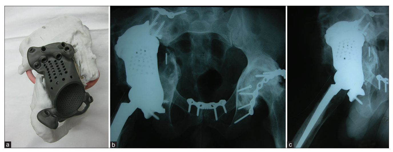
Figure 5: (a) Custom-made implant with the plaster model (b) postoperative X-ray pelvis anteroposterior view showing acetabular reconstructions (c) X-ray lateral view of the hip showing reconstructed acetabular defect