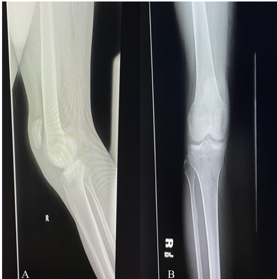
FIGURE 1: Radiograph of the right knee: (A) lateral view and (B) anteroposterior view showing the high-riding patella.