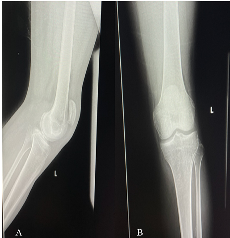
FIGURE 2: Radiograph of the left knee: (A) lateral and (B) anteroposterior view showing the high-riding patella.

Sonography of the bilateral lower extremities confirmed the diagnosis of bilateral patellar tendon rupture (Figures 3, 4).