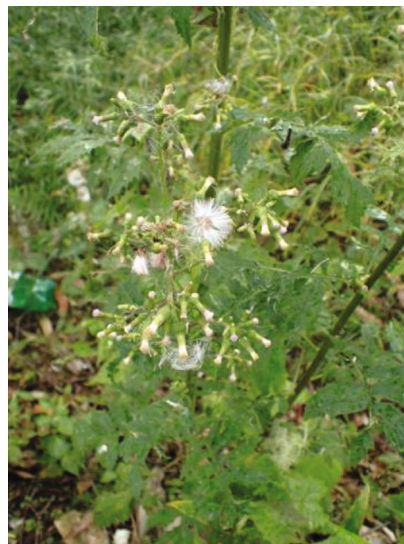
FIGURE 2: Erechtites valerianiaeolia (Link ex Spring) DC.

Bamboo, which originates from the Poaceae family, is native to Africa, Asia, and Central and South America and is widely related to indigenous culture and knowledge [16]. It is regarded as the fastest growing and most economically important plant in the world, with more than 1500 uses, such as in housing, utensils, furniture, handicraft, paper, agricultural activities, boats, bicycles, clothes, and among many others [17]. There are reportedly 70 species of bamboo found in both East and West Malaysia [18]. Dendrocalamus asper