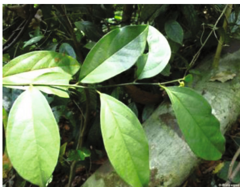
FIGURE 4: Gomphandra quadrifida (Blume) Sleumer.