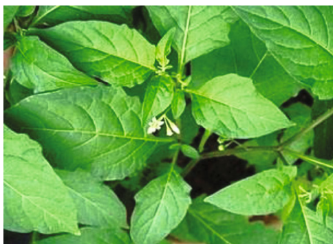
FIGURE 5: Solanum nigrum L.

semithick, and when cooking this vegetable, the shoots and leaves are boiled in water, with the water being replaced one or two times to prevent the consumption of toxins. Solanum nigrum is commonly used to treat high blood pressure, according to many Orang Asli informants, as they have been utilizing it to treat this ailment for the past three decades. The leaves are ground and made into a paste and then variously used.