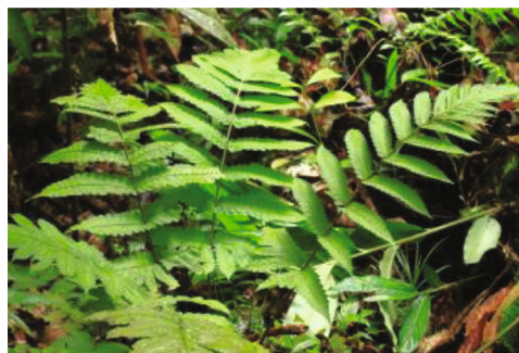
FIGURE 6: Plecnemia irregularis (C. Presl) Holttum.

Plecnemia irregularis (C. Presl) Holttum (Figure 6), also known as “ber-negy” among the Orang Asli, are considered native plants in Southeast Asia and are part of the Dryopter-