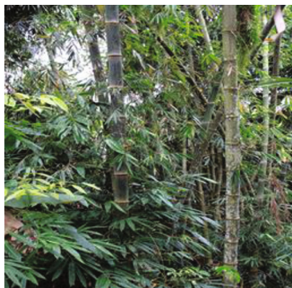
FIGURE 3: Dendrocalamus asper (Schult.) Backer.