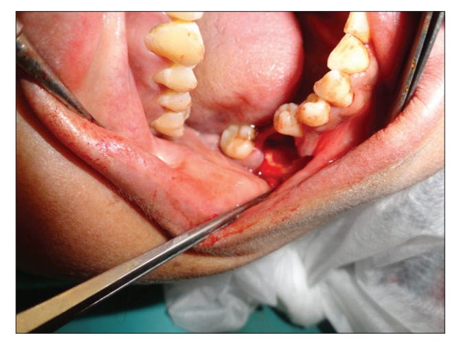
Figure 3: The day 0 status of the dry socket being prepared for the placement of gelatin sponge with PRGF