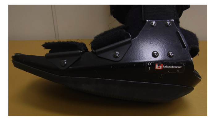
Figure 2. Rocker bottom sole of the walking boot.

Bengner U, Johnell O, Redlund-Johnell I. Epidemiology of ankle fracture 1950 and 1980. Increasing incidence in elderly women. Acta Orthop Scand. 1986;57:35–37.