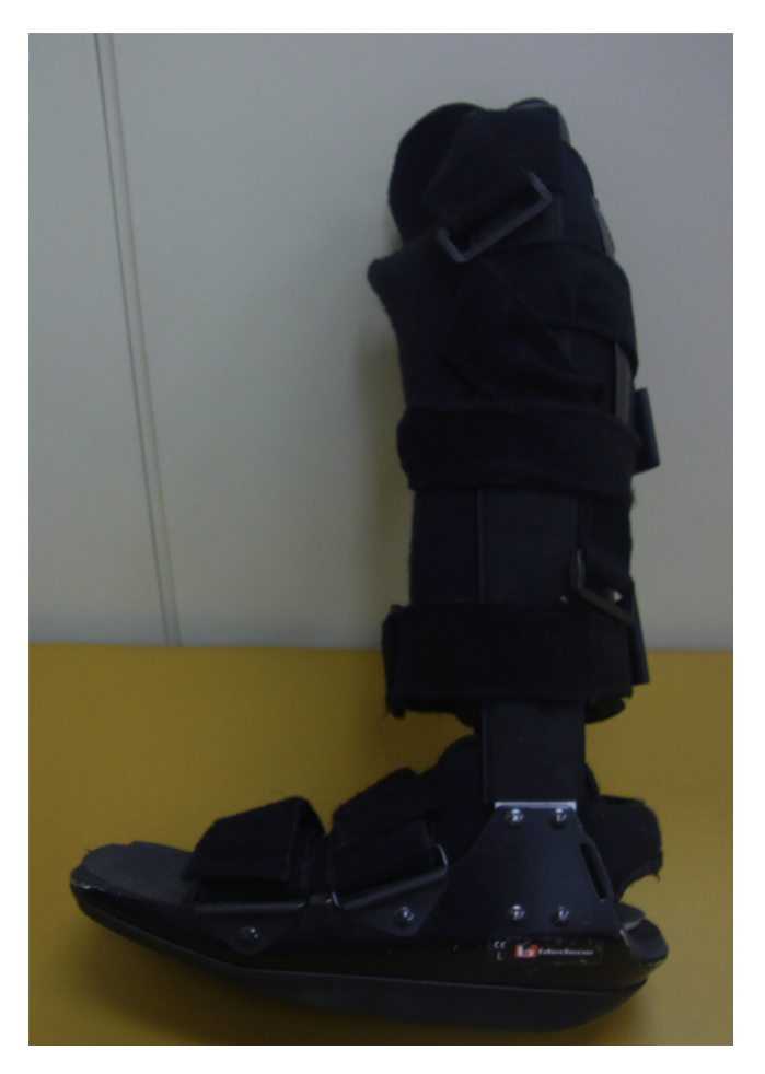
Figure 1. Bledsoe Walking Boot used in the study.

The records of 47 patients (mean age, 53.9 \pm 12 years) who were treated surgically for an ankle fracture at our hospital from January 2008 to October 2014 were reviewed retrospectively. This study was conducted in conformity with the principles of the Helsinki Declaration. The study was a retrospective review of the medical records and hence did not require a review by the Local Research Ethics Committee. The diagnosis was made with a plain radiograph, which was a displaced or an unstable fracture of the ankle including unimalleolar, bimalleolar, and trimalleolar injuries. Patients who were treated surgically and were followed up for at least 6 months were included. Patients with a pilon fracture of the tibia, an open fracture, multiple trauma, a history of previous ankle surgery, and who were unable to adhere to the postoperative protocol were excluded. The surgical procedure in all patients was an open reduction and an internal fixation in accordance with the AO/ASIF (Association for Osteosynthesis/Association for the study of Internal Fixation) methods.<sup>23</sup> Either a PC (25 patients) or a WB (22 patients) (Bledsoe Brace Systems, Grand Prairie, TX, USA: Figure 1) was prescribed postoperatively. The patient demographics are