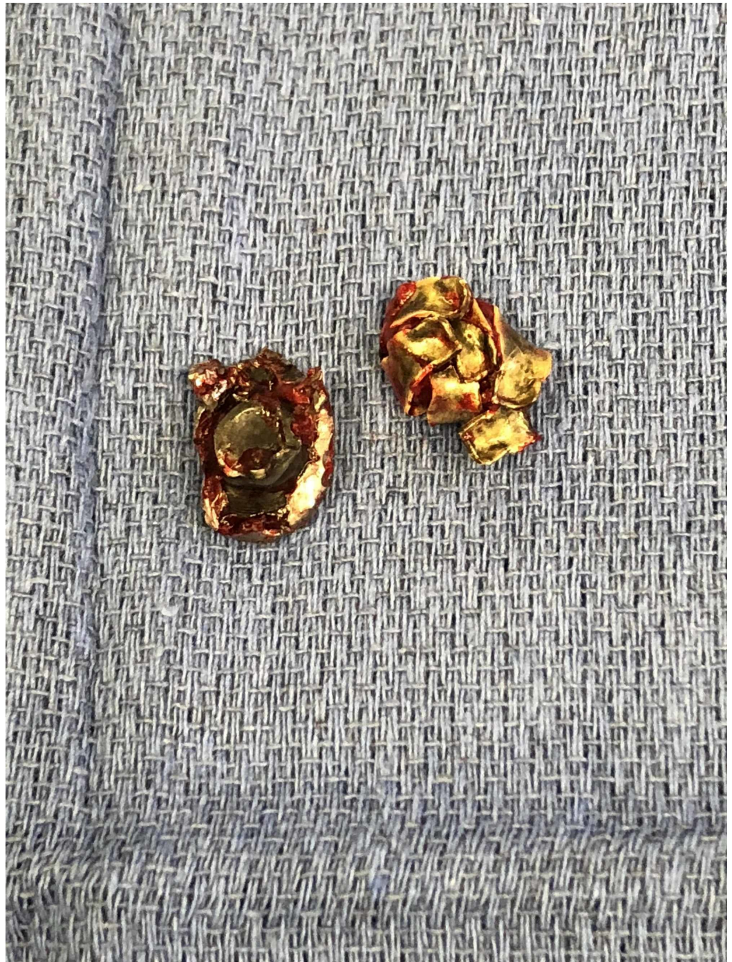
FIGURE 4: Foreign body