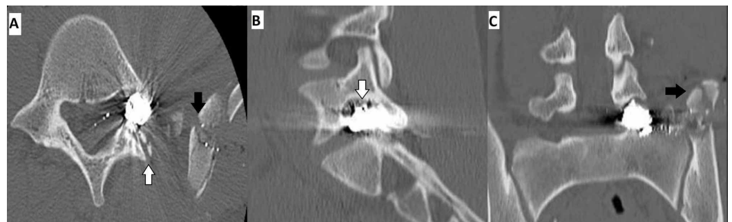
FIGURE 1: Preoperative CT scans demonstrating a high-density foreign body in the left articular facet of L5 neural foramen

A 17-year-old female with no significant medical history presented to the emergency department after sustaining a gunshot injury to the left hip while exiting a vehicle. On initial examination, she was found to have 4/5 power in her left tibialis anterior (TA) and extensor hallucis longus (EHL) as well as decreased sensation to light touch in the L5 dermatomal distribution with an otherwise intact examination. A small entry wound on the left lateral flank at the level of the iliac crest was observed. CT of the lumbar spine revealed a comminuted fracture of the left iliac crest with a bullet lodged in the left L5 neural foramen associated with a comminuted fracture of the left S1 superior articular facet, suggestive of a trajectory through the iliac bone in a superior-medial direction (Figure 1). Bony spinal elements appeared otherwise grossly intact around the foreign body (FB).