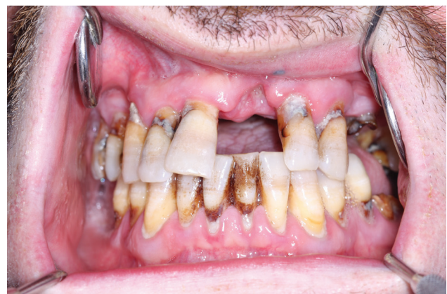
Figure 1. Generalized advanced chronic periodontitis in smooker

The relationship between smoking and periodontal health was investigated as early as the miiddle of last century. Smoking is an independent risk factor for the initiation, extent and severity of periodontal disease. Additionally, smoking can lower the chances for successful tretment. (Figure 1,2,3,4).