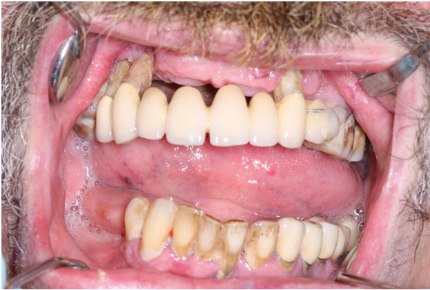
Figure 2. Generalized advanced chronic periodontitis in smoker

Cross-sectional and longitudinal data provide strong support for the statement that the risk of developing periodontal disease as measured by clinical attachment loss and alveolar bone loss increases with increased smoking. Studies find that former smokers (clinically defined as two or more years since quitting smoking) experience less attachment loss than current smokers but more than never-smokers. Furthermore, the likelihood of developing increasing periodontal disease exhibits dose dependency (5)