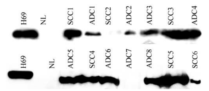
Figure 2 Western Blotting showing a 105 kDa hTERT product with hTERT 44F12 antibody in cancer cell line H69, normal lung (NL) and a subset of lung carcinoma including SCC and ADC