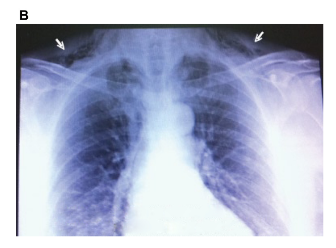
Figure I ( A ) X-ray of neck lateral incidence. ( B ) X-ray AP incidence. Notes: ( A ) Neck emphysema on the anterior side (arrows); ( B ) neck and mediastinal emphysema (arrows). Abbreviation: AP, anteroposterior.

The patient had a past history of face trauma for more than 20 years, with orbital fracture of the floor. This fracture was not previously correct by surgery and is considered as a scar nowadays (Figure 2B).