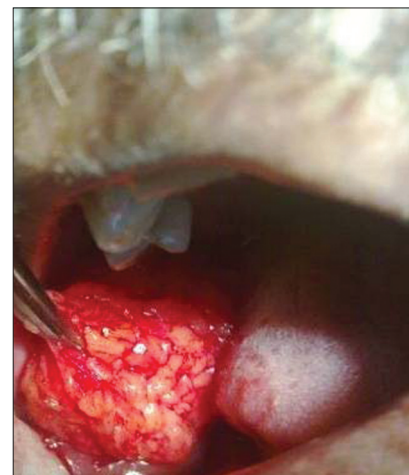
Figure 2: Surgical removal of the lesion via an intraoral approach