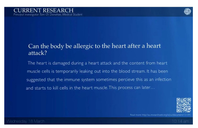
Figure 1 Example of presentation on the TV screen.

of different projects was done using a three-dimensional-like graphical rotation of texts. <sup>15</sup> A batch of 30 current projects related to relevant organisations was randomly selected from the online project database and retrieved. They were shown one at the time, and after the last one, another batch was randomly selected, retrieved and shown. Hence, the information on the TV screens was constantly renewed and kept updated. Each project was presented with a title and short abstract for laypersons as well as a web-link and QR code to more information (figure 1). A sign beside the TV screen stated: 'This screen highlights current local research. If you see a project you believe is relevant to your health or that of someone close to you, feel free to discuss with your doctor. The doctor may decide to contact the researcher if relevant. Feel free to take a photo of any slide (but not of any people around).'