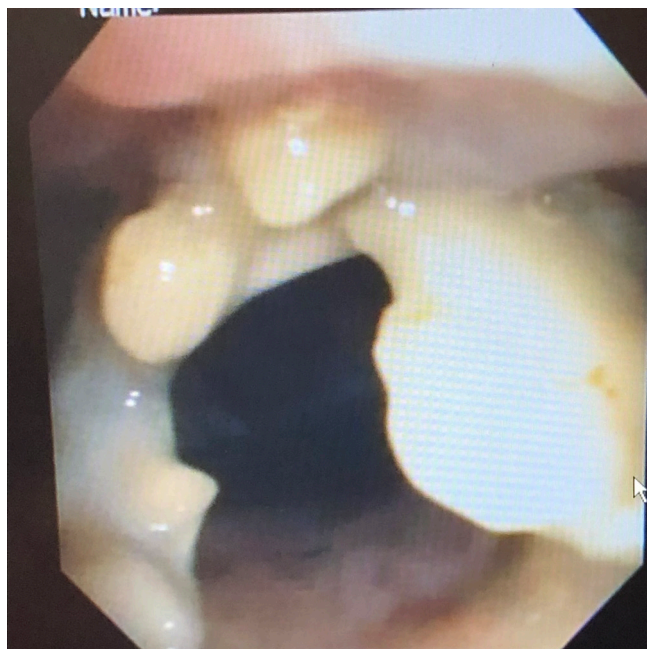
Fig. 4. Bronchoscopy image of oedematous tissue of the epiglottis with diffuse tissue damage

In contrast to acids, alkaline substances cause liquefaction necrosis as a result of reactions between alkali, proteins, and fats. Liquefaction necrosis causes deeper tissue penetration and a higher probability of transmural injury [7]. Alkaline substances are usually colourless, relatively tasteless, and viscid [4,7]. Due to their increased viscosity, alkalis have a decreased transit time through the oesophagus with a resultant increase in oesophageal injury [6]. Examples of alkaline substances include sodium and potassium, such as oven cleaner, liquid drain cleaners [4].