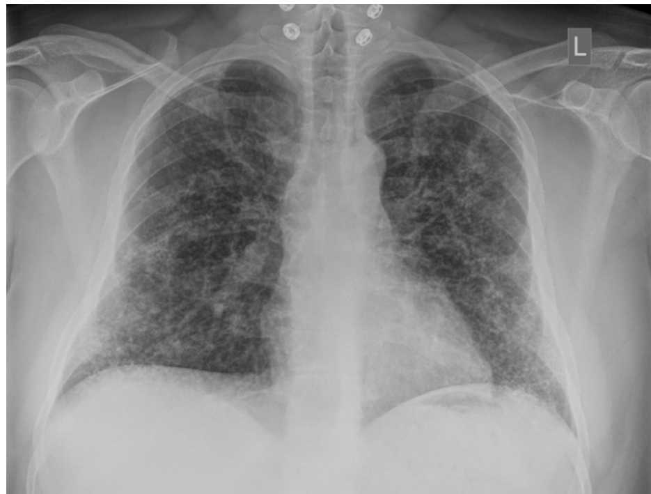
FIGURE 1: Erect chest X-ray (posteroanterior view)

A 35-year-old Bahraini male patient, non-smoker, with no previous medical illness, referred to the respiratory clinic for evaluation of abnormal chest X-ray which was showing bilateral reticulonodular opacities distributed all over lung zones, more prominently in the lower lobes (Figure 1).