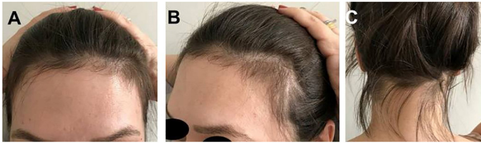
Figure 1 Case 1: (A), Frontal fringe. (B), hair rarefaction on the temporal region and (C), occipital fringe of hair regrowth after effluvium in the post-partum period.