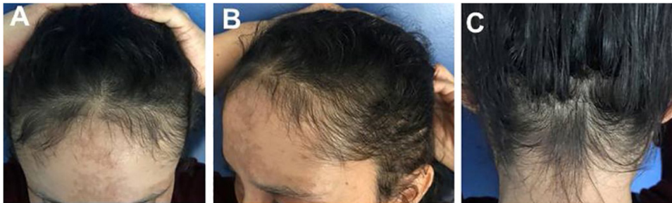
Figure 3 Case 3: (A), Frontal fringe. (B), Hair rarefaction on the temporal region and (C), occipital hair regrowth fringe after effluvium post-weight loss.

occipital area revealed several short hairs whose ends show these characteristics.