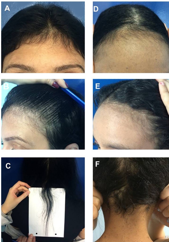
Figure 4 Case 4: (A), Frontal fringe. (B), hair rarefaction on the temporal region and (C), occipital hair regrowth fringe after a serious car accident; Case 5: (D), Frontal fringe, (E), temporal rarefaction and (F), occipital hair regrowth fringe post-effluvium after severe intestinal infection.

Knowledge of the clinical signs of hair regrowth after telogen effluvium can help in this differential diagnosis. As the frontal and temporal regions of the scalp have a greater