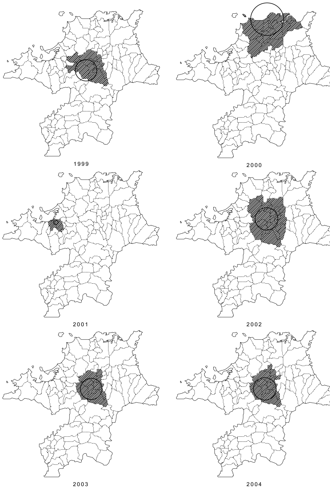
Figure 2 Locations of the detected clusters of TB cases from 1999 to 2004, based on a purely spatial analysis.