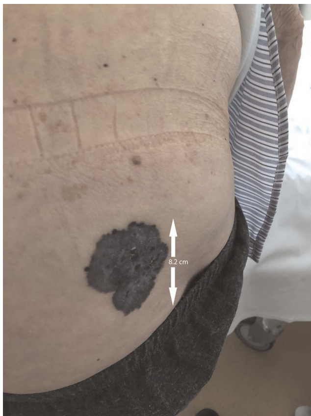
Figure 2. A deep brown skin lesion of the dorso-lumbar region, approximately 8.2 cm in width, with irregular borders, strongly suggestive for melanoma.

Possible explanations for collision metastases include: 1) involvement of carcinomas which are indolent and common (such as prostate cancer), [5,8] their frequency and long clinical course without any overt clinical symptoms may allow time for second