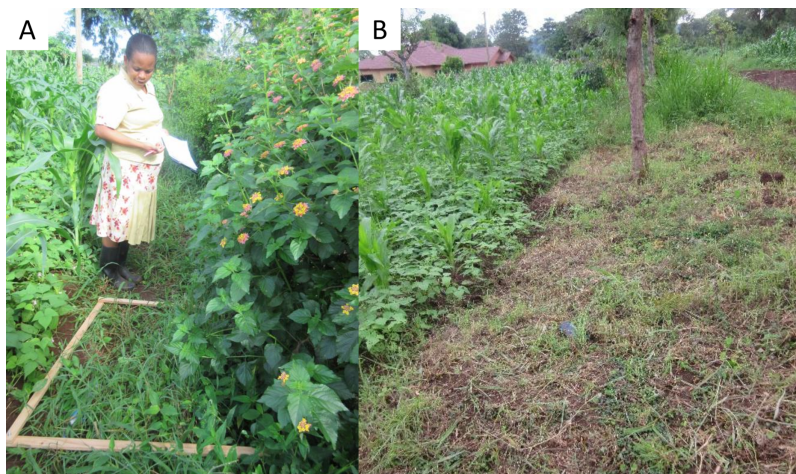
Figure 1 Field margin management practices, undisturbed (A) and disturbed (B). Undisturbed field margin vegetation around agricultural lands are useful in provision of nectar and habitat for beneficial arthropods thereby enhancing ecosystem services. Disturbed or cleared field margins are less efficient in enhancing beneficial arthropods.