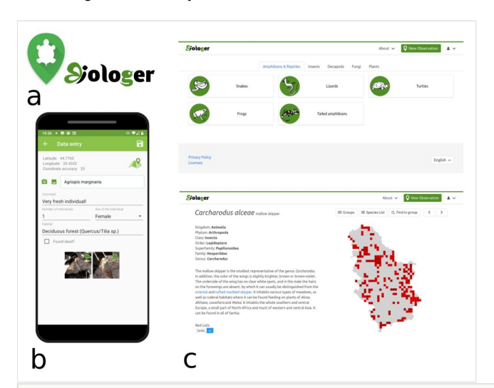
Figure 1. doi

200178). A significant part of the work is done on a voluntary basis through engagement of the Biologer community.