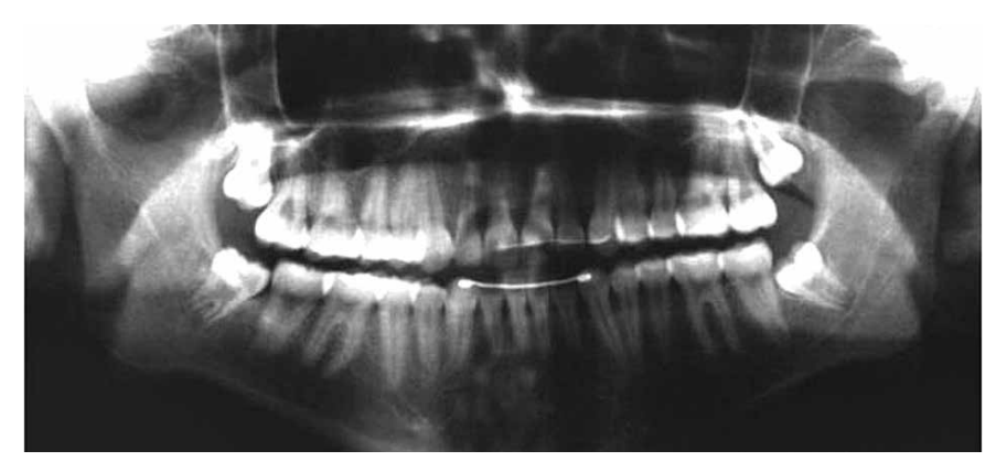
Figure 15 - Final panoramic radiograph.

The basal bone most often affected is the maxilla, with higher incidence of unilateral transposition, which, in this case, the left side prevailed. 12-24 The teeth mostly affected by transposition are canine and first premolar 12 as well as canine and lateral incisor. 25 The case reported herein presented incomplete transposition between the canine and lateral incisor on the left side, associated with impacted upper left central incisor.