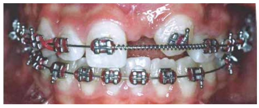
Figure 1 - Patient's initial photograph showing fixed appliance set with transposition between the upper left canine and lateral incisor, and the absence of upper central incisor on the same side.