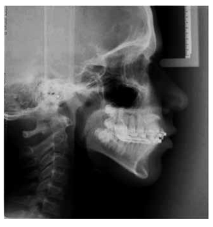
Figure 3 - Lateral cephalogram revealing impaction of tooth #21 with coronal long axis horizontally positioned between the middle and apical third of adjacent teeth roots.