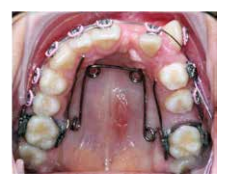
Figure 8 - Quad-helix appliance installed to maintain distalization of #26.