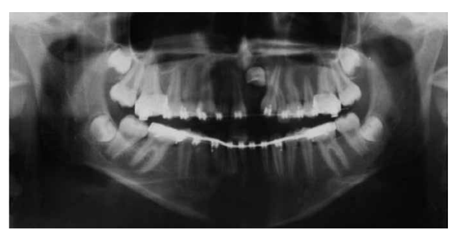
Figure 4 - Panoramic radiograph revealing impaction of tooth #21, #22 and #23 with incomplete transposition.