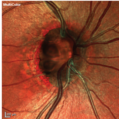
FIGURE 1: High definition fundal photo demonstrating architecture of double optic disc pit.