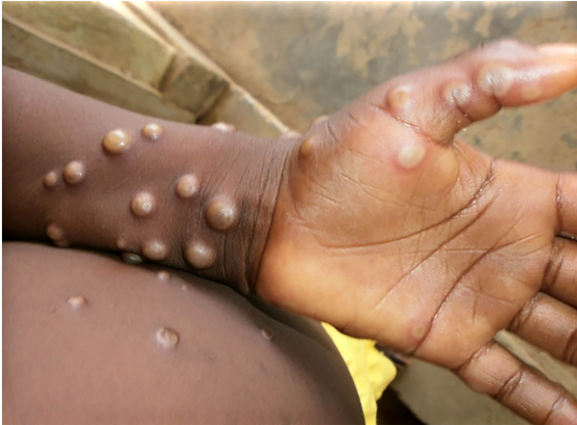
Fig. 3 – The wrist and palm of a patient with monkeypox, displaying the appearance of the papular and blister stage lesions prior to disruption and scab formation.

Of interest in the dental context is that the primary lesions originate in the oropharynx before manifesting on the skin. Occasionally, oral ulcers can impair a patient's ability to eat and drink, causing dehydration and malnutrition. 44 Perioral papules which blistered and ulcerated have been reported initially in the current outbreak. 27 In one study, it was reported that oral ulcers were present in almost one-quarter (23.5%) of participants with MPX. 45,46