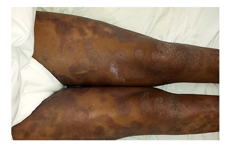
Fig. 2. Residual hyperchromic plaques from previous psoriasis on the thigh and scaly plaques on the knee and legs with onset 15 days before hospital admission.