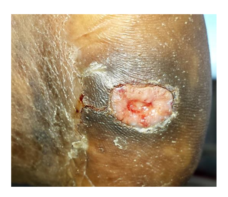
Fig. 1. Ulceration on the lateral face of the calcaneus of the right foot with onset 1 month before hospitalization.

Ferreira et al.: Atypical Manifestation of Disseminated Sporotrichosis in an AIDS Patient