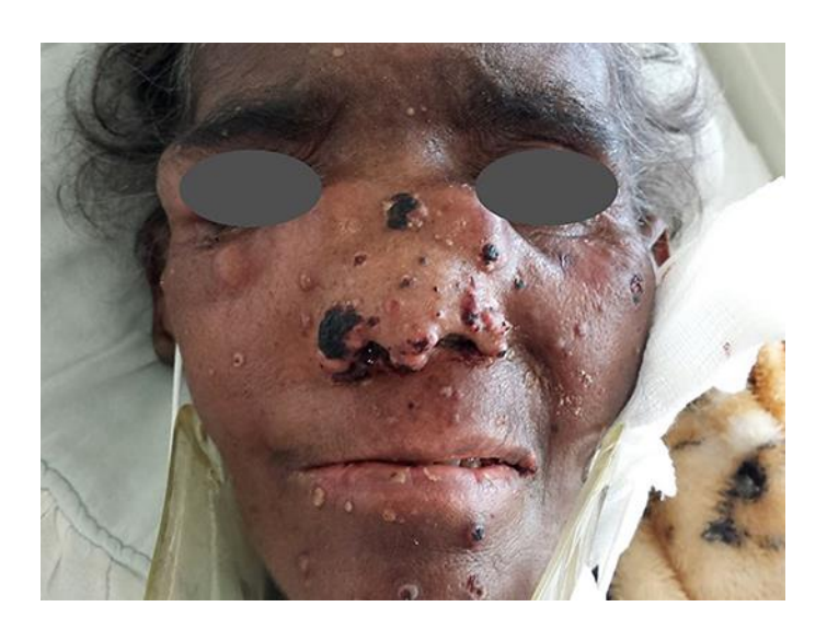
Fig. 3. Molluscum-like lesions on the face.

Ferreira et al.: Atypical Manifestation of Disseminated Sporotrichosis in an AIDS Patient