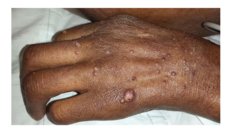
Fig. 4. Molluscum-like lesions on the hand.