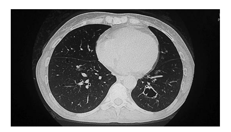
Fig. 5. Thorax CT at the time of admission revealing cavitation in the inferior lobe of the left lung.