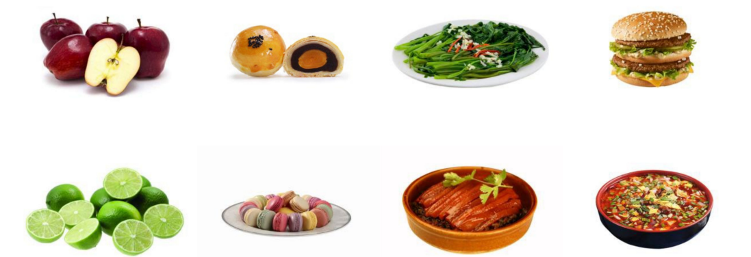
Figure 2. Samples of Chinese food images. The images are sourced from open-source photo websites.

After screening and analysis, the Chinese food image library established in this study contains 508 food images. According to the food pictured, the main types of images were divided into fruits (a total of 57 images, accounting for 11.2% of all food images), vegetables (12.4%), meat dishes (19.3%), seafood (12.0%), pulses (5.1%), staple foods (8.3%), Chinese pastries (9.6%), desserts (11.2%), nuts (5.0%), and other foods (5.9%). Furthermore, food pictures were divided into different categories according to the degree of food processing, energy content, and major tastes in the pictures. Of these, 120 pictures (23.6% of all pictures) were placed in the unprocessed food group and 388 pictures (76.4% of all pictures) were placed in the processed food group. There are 174 images in the low-energy food group (34.3% of all pictures) and 334 images in the high-energy food group (65.7% of all pictures). The sweet food group contains 167 images (32.9% of all pictures) and the salty delicious food group has 192 images (37.8% of all pictures). A total of 43 pictures (8.5%) were placed in the spicy food group, and 29 pictures (5.7%) were placed in the sour food group. The main tastes of a total of 77 food images (15.2% of all images) were difficult to determine. Samples of the Chinese food images are shown in Figure 2.