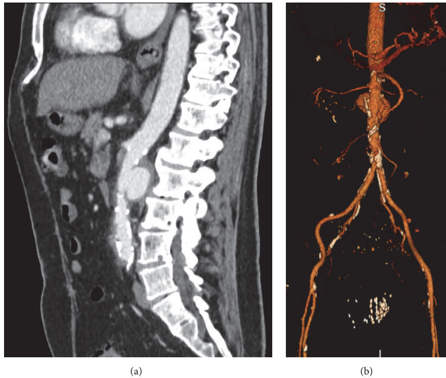
FIGURE 1: CT image and 3D reconstruction of aneurysm. (a) Sagittal CT shows saccular infrarenal aneurysm with surrounding inflammation. (b) 3D reconstruction demonstrates that the relation of the aneurysm to major abdominal arteries calcifications can be readily identified.

more a few months later to an outside facility with worsening rigors, chills, and fevers. A chest X-ray was concerning for pneumonia which was treated with cefuroxime.