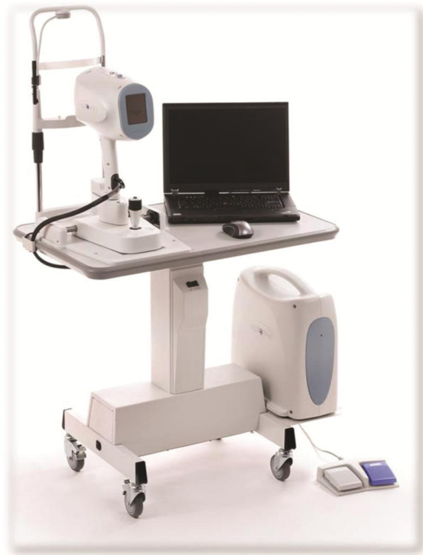
Figure 1 Photograph of the spectral-domain optical coherence tomography device used intraoperatively during Descemet's stripping and automated endothelial keratoplasty.

donor insertion and immediately prior to full air tamponade; (2) after air tamponade and expression of fluid from the venting incisions; (3) at 6 minutes of air tamponade; and (4) at 10 minutes of air tamponade to measure the donor, recipient, and interface fluid gap thicknesses. In one patient, SD-OCT imaging was performed after air tamponade and immediately before the expression of fluid from the venting incisions.