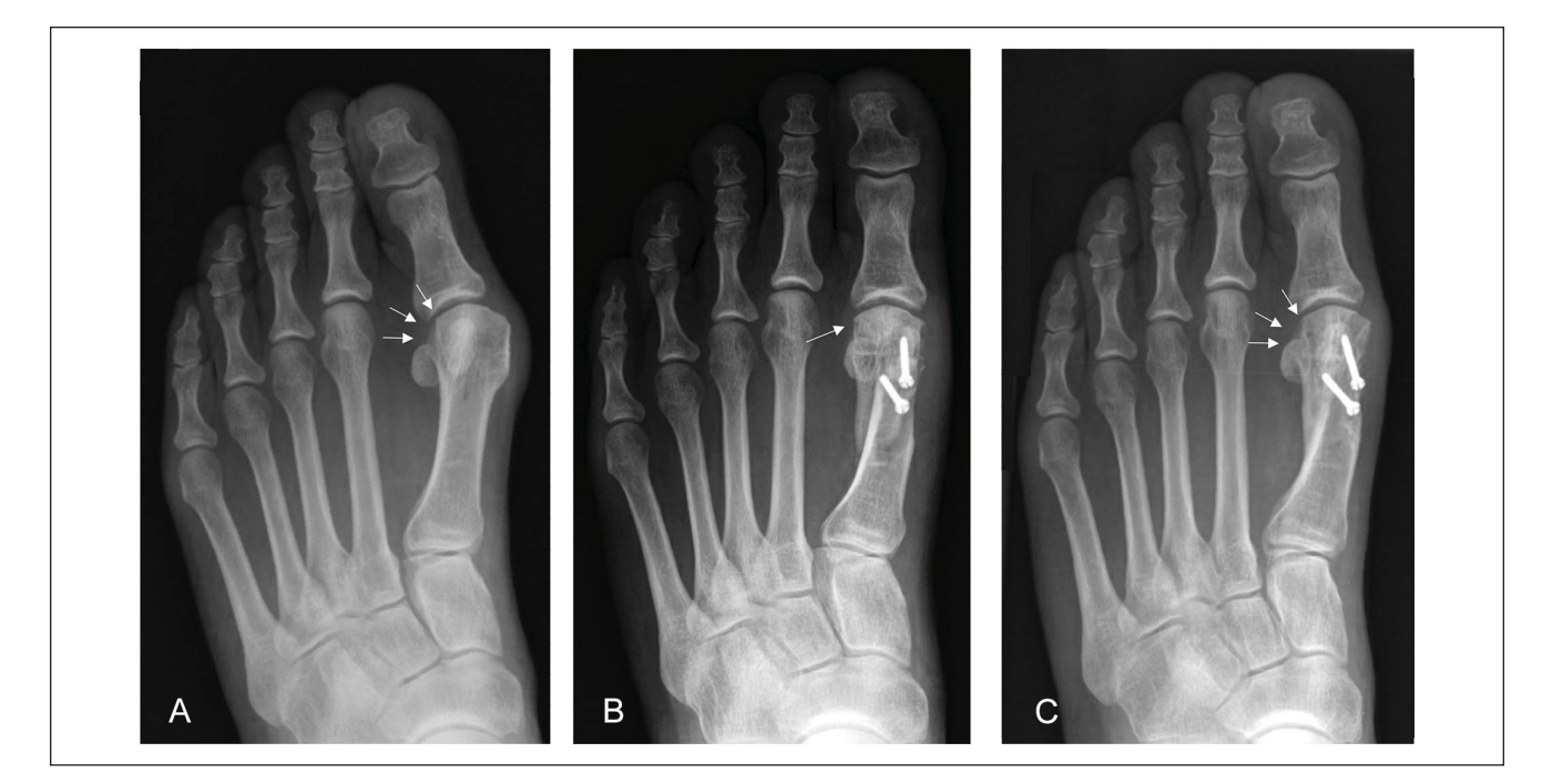
Figure 3. Dorsoplantar weightbearing foot radiographs showing the changes in the round sign over time. The preoperatively roundshaped lateral metatarsal head (A, arrows) changed to an angular shape at the 6-week follow-up (B, arrowhead) and changed back to a round shape until at the I-year follow-up (C, arrows).