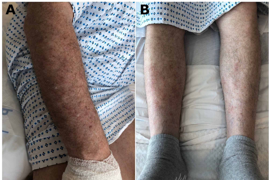
FIGURE 2: Maculopapular lesions with scratch marks located in the right forearm (A) and lower extremities (B)

No other relevant physical examination findings were identified. He underwent a laboratory workup including complete blood count, chemistries, and inflammatory markers including erythrocyte sedimentation rate and C-reactive protein, which were all within normal limits. Further workup included a potassium hydroxide (KOH) preparation negative for fungal infection, and negative bacterial and viral cultures. A skin scraping with microscopy was performed, which was negative for scabies. Dermatology was consulted and agreed with a clinical diagnosis of DE and deemed that further workup including a skin biopsy was not necessary. The patient was treated with local care, which included the use of compresses and soaks with Burow's solution. Drainage of the larger vesicles was also performed. Given the extensive lesions covering the bilateral hands, forearms, and legs, a short course of prednisone was recommended. Pruritus was treated effectively with diphenhydramine. The patient's lesions improved significantly following the treatment.