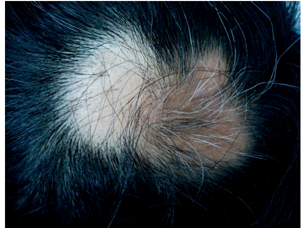
Figure 4. Case 4. A patch of well-demarcated hair loss lesion with a diameter of about 12 cm × 7 cm on the vertex of the scalp. Some gray hairs and black hairs were distributed among the patch of hair loss. Exclamation mark hairs at the periphery of areas of hair loss

an important role [9]. It is demonstrated that hair follicle melanocyte is one of the targets [10]. Ultrastructural evidence proves that hair bulb melanocytes are specifically damaged in acute alopecia areata, even before any damage is morphologically detectable in hair bulb keratinocytes [11]. Epitope spreading is likely to have a role in the broad nature of the anti-melanocyte response [12].