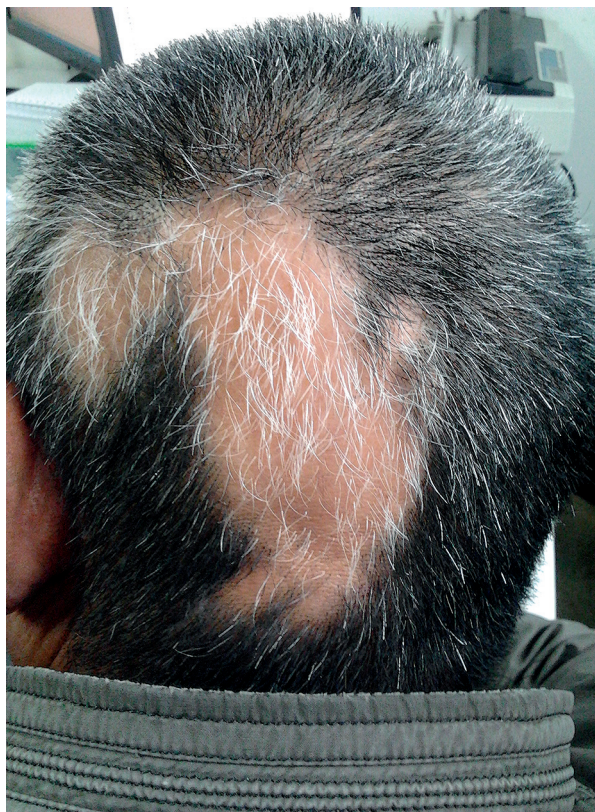
Figure 1. Case 1. Two patches of well-demarcated lesions of about 10 cm × 5 cm and 3 cm × 2 cm on the occipital scalp. Gray hairs were distributed among the patch of hair loss, with similar density to the gray hairs over normal area of scalp and similar diameter and length to the pigmented hairs. No pigmented hairs were on the shedding patches