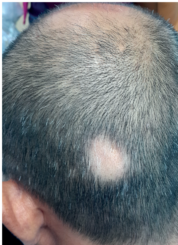
Figure 2. Case 2. A patch of well-demarcated, about 1.5 cm sized patchy hair loss on the occipital scalp, among which some gray hairs were distributed. No pigmented hairs were seen over the hair loss patch

some gray. On physical examination, there was a patch of well-demarcated hair loss lesion with a diameter of about 12 cm × 7 cm on the vertex of the scalp. Some gray hairs and black hairs were distributed among the patch of hair loss, which showed the similar diameter and length to the hair on the normal scalp. Exclamation mark hairs were seen at the periphery of areas of hair loss (Figure 4). Alopecia areata was diagnosed.