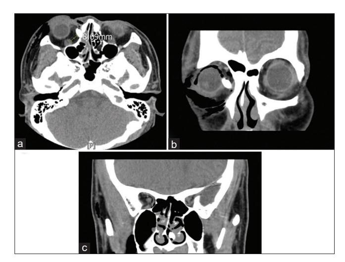
Figure 2: (a) Axial computed tomography showing a hyperdense foreign body in the right orbit with approximate attenuation values of 500–550 Hounsfield units. This is 8 mm from the optic nerve. (b) Computed tomography coronal section showing orbital foreign body penetrating the medial wall to the nasal cavity. (c) Computed tomography coronal section showing orbital foreign body penetrating the nasal septum to the contralateral nasal cavity

Clinical signs may not be immediately apparent in cases of orbital penetrating injury.<sup>[4]</sup> This type of injury requires an image study to determine whether there is a retained intra-OrbFB. A full radiological workup must precede removal of the foreign object.<sup>[4]</sup> Noncontrast CT scanning is the preferred imaging modality. Advances