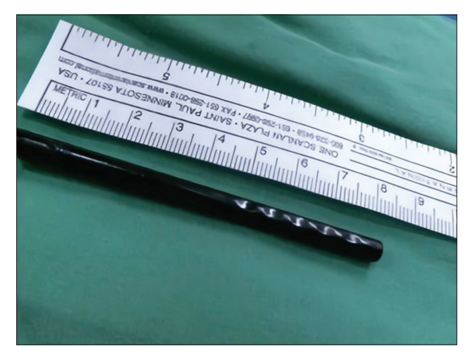
Figure 5: The chopstick was measured to be approximately 8 cm long after complete removal

in software and image quality mean that 3D CT offers a clear orientation and shows the extent of tissue injury. In this case, a rod clearly penetrates from the right orbit to the nasal cavity, crossing the nasal septum. A transnasal