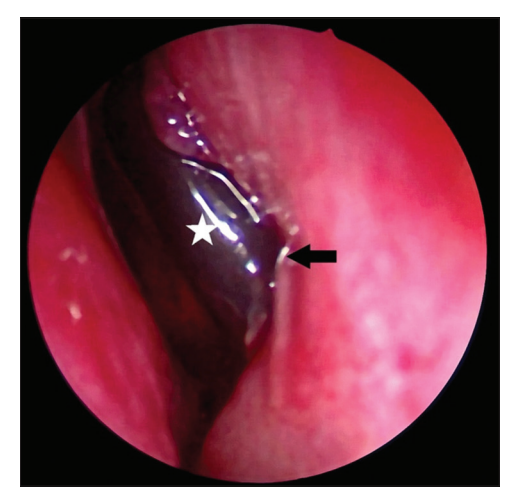
Figure 4: Orbital foreign body seen through the transnasal endoscope. Arrow: Penetrating site at the nasal septum. Star: orbital foreign body