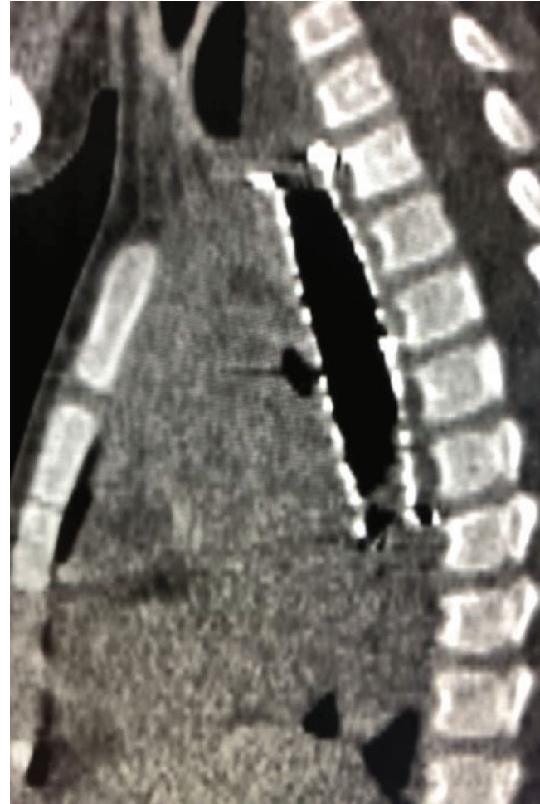
FIGURE 3: A SEMS under the esophageal stricture line.

The presence of various stent designs, each with different characteristics, has increased their use. Although the most common indication for esophageal stents is palliation of malignant dysphagia in adults [1], nowadays they are used for a wide variety of esophageal diseases, even in children [2]. Recalcitrant benign esophageal strictures due to corrosive ingestion is the most common indication for esophageal stents in children [2]. They are also used successfully in the