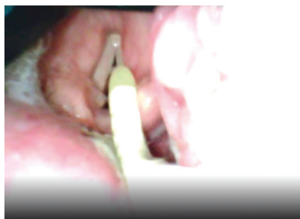
FIGURE 3: Flexible-tipped bougie in flexed position.

tube introducer demonstrated superiority with respect to first pass success, time to intubation, and airway trauma compared with a videolaryngoscope using a preshaped nondynamic stylet-guided endotracheal tube [3]. We feel