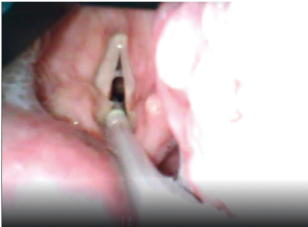
FIGURE 4: Flexible-tipped bougie in neutral position.

that our patient may have been more difficult to intubate with a stylet-guided endotracheal tube as the available glottic visibility was significantly reduced by the large tumor. The much smaller diameter of the flexible-tipped bougie and the ability to flex into the laryngeal inlet and then extend down the trachea made a potentially difficult intubation seem straightforward.